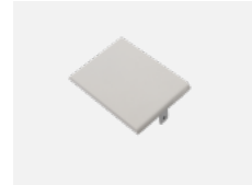
132-50100, W end cap