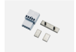
132-50200, F straight connector