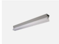
132-50031, W pendant profile 1000 mm