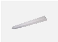
132-51100, K diffuser 2295 mm