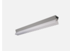
132-50031, S pendant profile 1000 mm