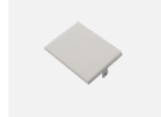
132-50100, S end cap