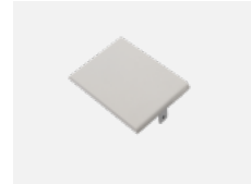
132-50100, B end cap