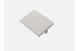
132-50100, S end cap