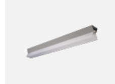
132-50031, S pendant profile 1000 mm