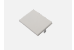
132-50100, B end cap