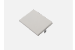
132-50100, W end cap