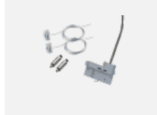
00-51300, W set for suspension into 3-phase track, non- dimmable luminaires