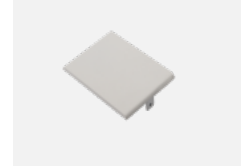
132-50100, B end cap