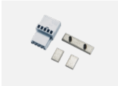
132-50200, F straight connector