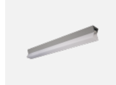
132-50031, B pendant profile 1000 mm