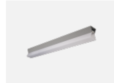
132-50031, B pendant profile 1000 mm