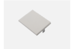
132-50100, B end cap