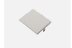
132-50100, B end cap