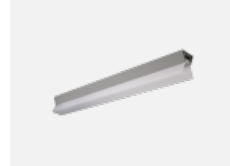
132-50031, S pendant profile 1000 mm