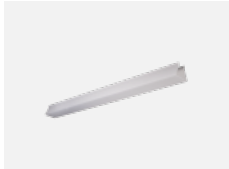
132-51100, K diffuser 2295 mm