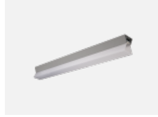
132-50031, S pendant profile 1000 mm