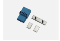
132-50201, F straight connector (for dimmable lum.)