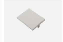
132-50100, W end cap