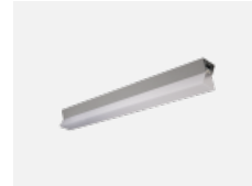
132-50031, W pendant profile 1000 mm