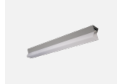
132-50031, W pendant profile 1000 mm