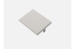
132-50100, W end cap