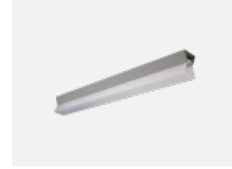
132-50031, S pendant profile 1000 mm