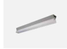
132-50031, W pendant profile 1000 mm