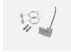
00-51300, W set for suspension into 3-phase track, non- dimmable luminaires