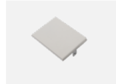
132-50100, S end cap