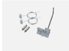
00-51300, W set for suspension into 3-phase track, non- dimmable luminaires