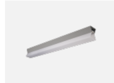
132-50031, W pendant profile 1000 mm