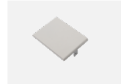
132-50100, W end cap