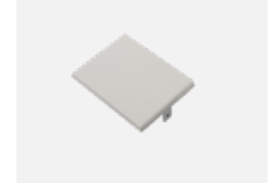
132-50100, W end cap