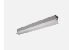
132-50031, W pendant profile 1000 mm