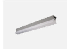
132-50031, S pendant profile 1000 mm