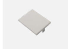
132-50100, W end cap