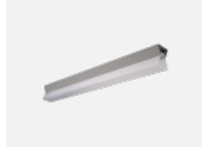
132-50031, W pendant profile 1000 mm