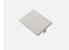
132-50100, S end cap