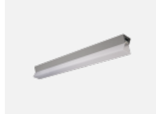
132-50031, B pendant profile 1000 mm