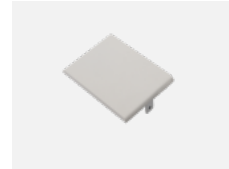
132-50100, B end cap