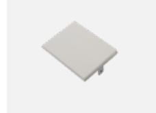
132-50100, B end cap