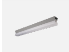
132-50031, B pendant profile 1000 mm