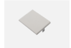
132-50100, S end cap