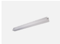
132-51100, K diffuser 2295 mm