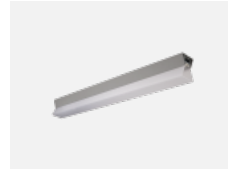
132-50031, S pendant profile 1000 mm