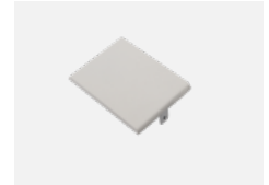
132-50100, S end cap