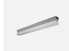
132-50031, B pendant profile 1000 mm