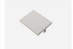
132-50100, B end cap