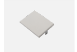
132-50100, S end cap