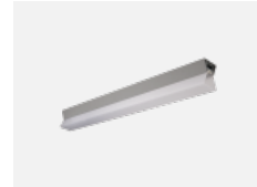
132-50031, S pendant profile 1000 mm