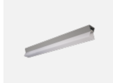
132-50031, W pendant profile 1000 mm