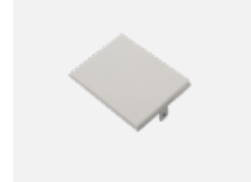
132-50100, W end cap