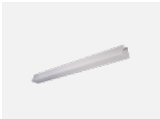
132-51100, K diffuser 2295 mm