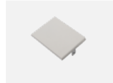
132-50100, S end cap