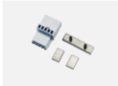
132-50200, F straight connector