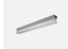
132-50031, B pendant profile 1000 mm