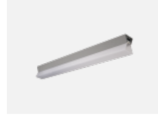
132-50031, B pendant profile 1000 mm