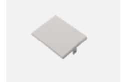
132-50100, B end cap