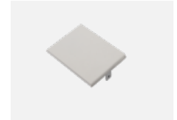
132-50100, B end cap