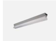
132-50031, B pendant profile 1000 mm