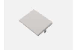
132-50100, S end cap