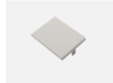
132-50100, W end cap