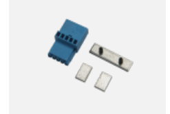
132-50201, F straight connector (for dimmable lum.)