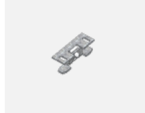
00-00600, F ceiling fastening for luminaires 132-5xxK, 04-2000x, 05-2000x, 09-200x – 1 piece