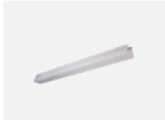
132-51100, K diffuser 2295 mm