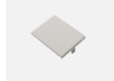
132-50100, W end cap