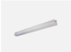
132-51100, K diffuser 2295 mm