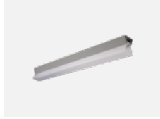
132-50031, S pendant profile 1000 mm