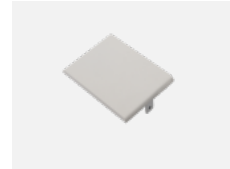
132-50100, S end cap