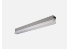
132-50031, S pendant profile 1000 mm