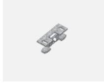
00-00600, F ceiling fastening for luminaires 132-5xxK, 04-2000x, 05-2000x, 09-200x – 1 piece