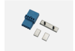
132-50201, F straight connector (for dimmable lum.)