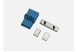
132-50201, F straight connector (for dimmable lum.)