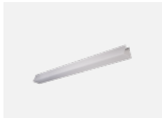
132-51100, K diffuser 2295 mm