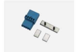
132-50201, F straight connector (for dimmable lum.)