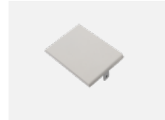
132-50100, B end cap