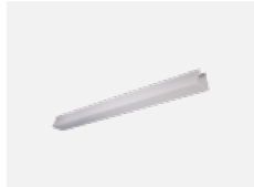
132-51100, K diffuser 2295 mm