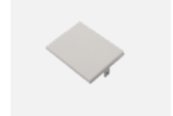
132-50100, B end cap