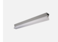
132-50031, B pendant profile 1000 mm