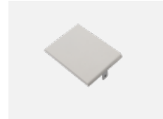
132-50100, W end cap