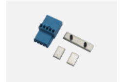
132-50201, F straight connector (for dimmable lum.)