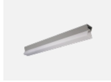
132-50031, S pendant profile 1000 mm