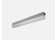
132-50031, S pendant profile 1000 mm