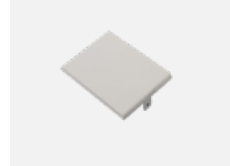
132-50100, S end cap