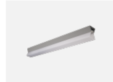
132-50031, W pendant profile 1000 mm