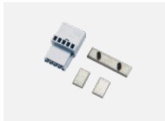
132-50200, F straight connector