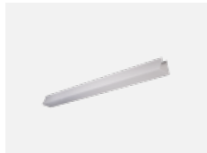
132-51100, K diffuser 2295 mm