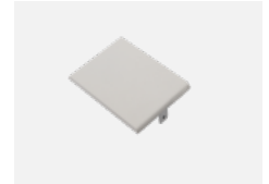
132-50100, W end cap