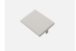
132-50100, S end cap