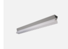
132-50031, S pendant profile 1000 mm