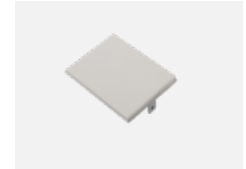
132-50100, S end cap