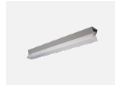
132-50031, S pendant profile 1000 mm