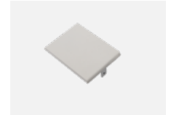
132-50100, S end cap