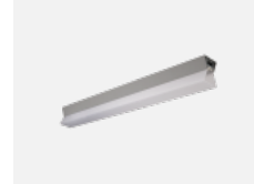
132-50031, B pendant profile 1000 mm