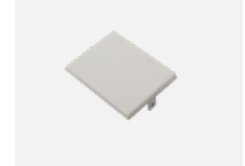
132-50100, B end cap