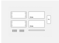
121-20101, S 2xend cap - plastic