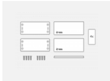
121-20101, W 2xend cap - plastic