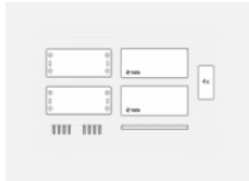
121-20101, B 2xend cap - plastic