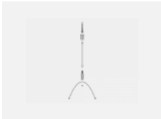
121-00302, N wire suspension 6000mm