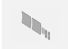
121-00200, N straight connector