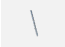
00-00364, K cable 5x1,5 4000mm