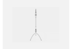
121-00301, N wire suspension 4000mm