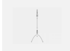
121-00300, N wire suspension 2000mm