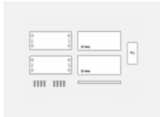
121-20101, W 2xend cap - plastic