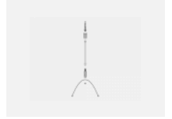
121-00301, N wire suspension 4000mm