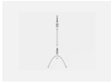
121-00302, N wire suspension 6000mm