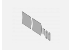
121-00200, N straight connector