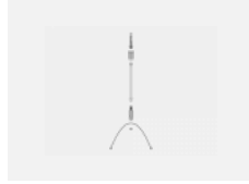
121-00300, N wire suspension 2000mm